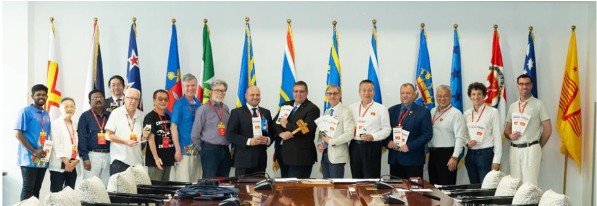
Delegates at GA28