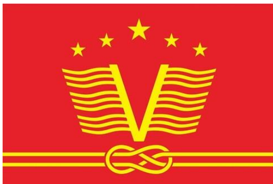
The Congress flag for ICV30