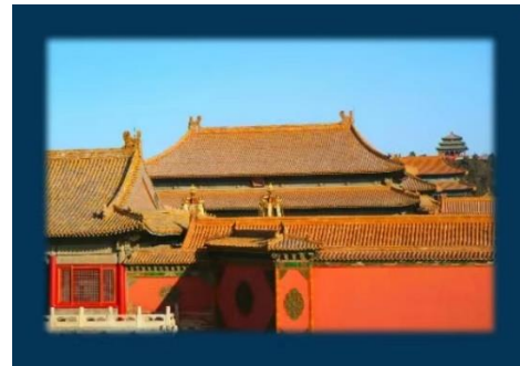
The Forbidden City