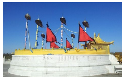
Genghis Khan's mausoleum: the sulde altar