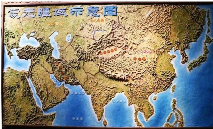
At its height the Mongol Empire ran from Turkey and Poland to the Korean peninsula, including all of modern China

Genghis Khan is renowned as a conqueror of the world. He and his descendants led the Mongolian cavalry in a whirlwind across the Eurasian continent, acquiring a territory of 34 million square kilometres.