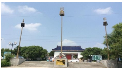
Three suldes in front of the Genghis Khan Temple

The third is the Alag Sulde, which means 'mixed-colour flag'. It has both white and black manes, and is often shaped like a spear or trident, with a disk attached to it. The Alag Sulde is the flag that was awarded to feudatory kings who rendered outstanding services. Genghis Khan and his followers raised their suldes and swept across the Eurasian continent, acquiring 34 million square kilometres of territory. That is when the glory of the suldes reached its peak and nothing since has surpassed it.