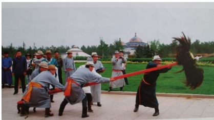
Rituals at the Hara Sulde sacrificial ceremony

The ceremony starts with the chanting of 81 Darkhad guards, which celebrates the accomplishments of the Khan and the suldes. Then four strong Darkhad men respectfully remove the Hara Sulde from the altar and march forward while shaking the sulde. After that, the Hara Sulde will be returned to the altar; this is known as 'Yehe Tahlilga'. During the Year of the Tiger or the Year of the Dragon [next in 2022 and 2024 respectively], the ceremonies are even more solemn and magnificent, and the manes and other decorations on the suldes are also refreshed.