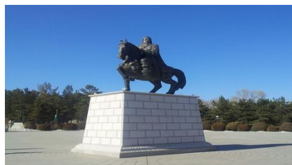
Left, the Darkhad people have guarded the mausoleum for over 800 years; right, despite the passage of time the passion for and worship of Genghis Khan and the suldes will never fade