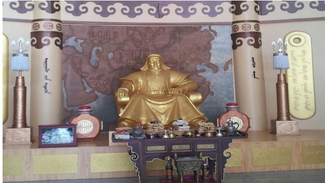
Flanked by two suldes, a golden statue of Genghis Khan seated before a map of his conquests

Kiyad tribe – defeated the Tatars and captured their leader Temüjin-üge. The boy was named Temüjin ('iron-willed') after the enemy chief, and he did indeed turn out to be a courageous young man.