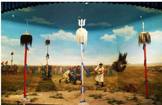
Three types of flags in the era of Genghis Khan: the Qagaan Sulde, Hara Sulde and Alag Sulde

The nine white banners represent nine suldes, with the main sulde in the middle surrounded by eight accompanying suldes. This format remains to this day. Judging by the fact that the steppe tribes still lacked the ability to create characters, or to weave or dye flags. I believe the 'nine white banners' means nine suldes.