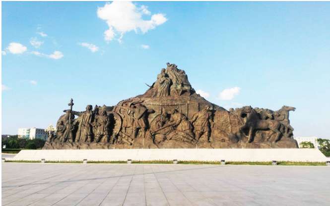
Statue depicting the life of Genghis Khan, City Square, Ordos

When he was nine years old, his father was killed, poisoned by an enemy tribe. As a result, the Kiyad fell apart in an instant and everyone began leaving to join the stronger enemy tribe. Temüjin's mother Hoelun chased after the departing Kiyad herdsmen with a black sulde in her hands, and succeeded in halting some of them. However, without a tribal leader, they eventually left once again. Temüjin and Hoelun went from being the head of a tribe to having to earn their own livelihood. All they had was eight horses, and Temüjin and his half-brothers were constantly fighting over food. Finally, Temüjin and his younger brother killed his half-brother Begter. Despite of being scolded by his mother, Temüjin thus began his life of killing and battle.