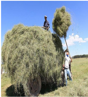
The distinctive shape of the sulde originated in farming equipment

The first is the Qagaan Sulde; qagaan means 'white' in Mongolian. The flag has a trident top; below is a disk pierced with 81 holes, through which are fastened the manes of white stallions, all borne on a pine flagpole. The Qagaan Sulde is the national flag, used during important events and ceremonies connected with Genghis Khan.