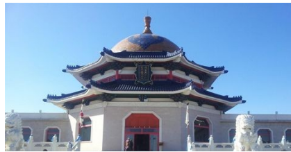
Genghis Khan's mausoleum, built by the Chinese Government in 1945

The ceremony starts with the chanting of 81 Darkhad guards, which celebrates the accomplishments of the Khan and the suldes. Then four strong Darkhad men respectfully remove the Hara Sulde from the altar and march forward while shaking the sulde. After that, the Hara Sulde will be returned to the altar; this is known as 'Yehe Tahlilga'. During the Year of the Tiger or the Year of the Dragon [next in 2022 and 2024 respectively], the ceremonies are even more solemn and magnificent, and the manes and other decorations on the suldes are also refreshed.