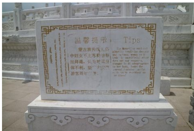
The tradition that women cannot approach the sulde altar continues

Although the Yuan Dynasty ended in 1368 AD, the tradition of worshipping Genghis Khan and the suldes remains. At Genghis Khan’s Mausoleum in Ordos, China, stands an enormous altar that enshrines the ancient Hara Sulde. According to Mongolian traditions, women cannot approach the suldes, and that still remains the case. Qagaan Suldes are enshrined on the steppe of Uxin Banner, Ordos. The sacrificial ceremonies include daily, monthly and seasonal ceremonies. The mausoleum is guarded by the Darkhad people, who have continually upheld this responsibility for 800 years. Even when the Japanese army invaded the steppe, the Darkhad transferred the holy relics of the Khan to Xinglong mountain in Lanzhou and maintained their guard.