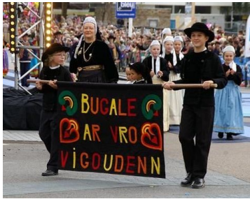
Bagad of Pont l'Abbé (Pont-'n-Abad): the flag of the junior section