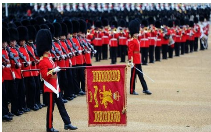
The Welsh Guards troop their colour on the Queen's Birthday in almost identical fashion!

Again, I have no idea whether in other parts of the world flags are displayed in the way used by Breton bands and circles, except perhaps some Celtic or other national groups that once visited Lorient or elsewhere in Brittany and are now copying us. Here in London, however, 'Trooping the Colour' is another horizontal display too, isn't it?