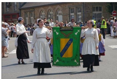
Flag of Les Blés d'Or, a circle from Saint-Nicolas-du-Pélem (Sant-Nikolaz-ar-Pelem)