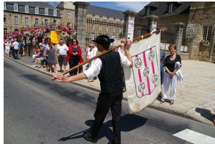
Flag of the Circle of Rostrenen (Rostren): obverse and reverse