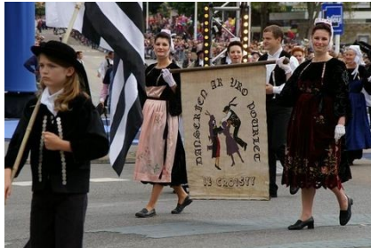
Flag of the Circle Dansérien Ar Vro Pourlet, from Le Croisty (Ar C'hroesti)