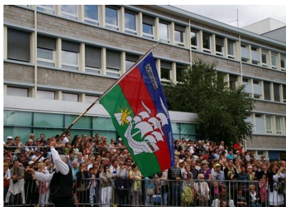
Festival Interceltique, Lorient: the flags are paraded ahead of the groups, whether bagad or circle