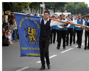
Flag of the Bagad of Saint-Brieuc (Sant-Brieg)