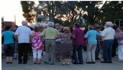
Breton folk dancing: in formal (left) and informal (above) settings