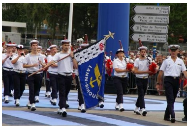
The Bagad of Lann-Bihoué Naval Air Base