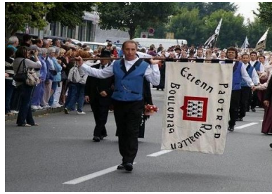
The flags of the Bagad and Circle of Bourbriac (Boulvriac) are almost identical

Instead of a conventional flagpole, some groups use a traditional work tool, such as a paddle from the port of Saint-Malo, or a scythe from Auray.