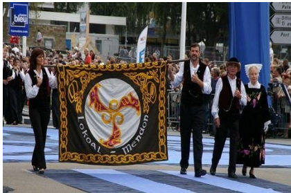
Flag of a bagad from Locoal-Mendon (Lokoal-Mendon), with triskell symbolism well to the fore