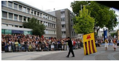
Bagad of Pont l'Abbé (Pont-'n-Abad): its flag reflects the distinctive tall hats of the Bigouden area, which are worn by its female members