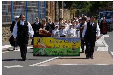
A different flag of the Circle of Nort-sur-Erdre, near Nantes