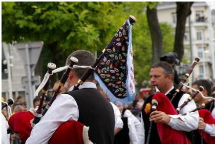
The pipe banner of the Penn Soner: the winner at Lorient in 2010 was Bagad Kemper, from Quimper, champions 22 times since 1951

The 'band master' of the champion band (the Penn Soner ) at each year's Lorient festival receives a specially embroidered pipe banner.