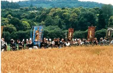
Gonfalons: above, carried in religious processions, Syria and Spain; left, carried in a religious ceremony, Locronan, Brittany, 2013

Therefore there is nothing especially Breton about these two methods of displaying flags – everyone of us can give many examples. But the third way, that is another story, and I don't know of anywhere else in the world where this uncommon way of displaying flags can be seen.