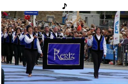
The bagad Keriz welcomes Bretons living in Paris: its name is a pun on the