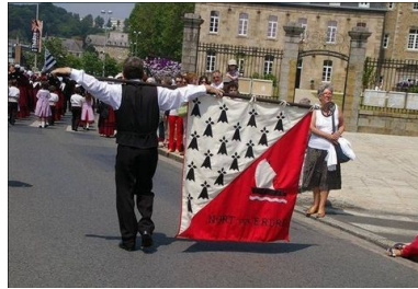
Flag of the Circle of Nort-sur-Erdre (Enorz), near Nantes: obverse and reverse