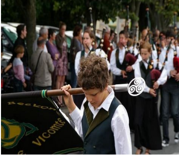
A triskell finial

Left, an ermine finial; right, a finial in the form of an ermine spot