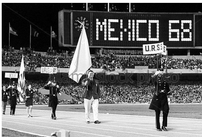
Olympic weightlifter Leonid Jabotinsky carries the USSR flag in one hand

To distinguish between the banners, however, the two groups had to be carried differently. You know from my lecture at Sydney that religious banners were carried on a central pole but how could the music and dance groups present their emblem in a distinctive way? That is the question, as Hamlet once said, close to where I am speaking today.