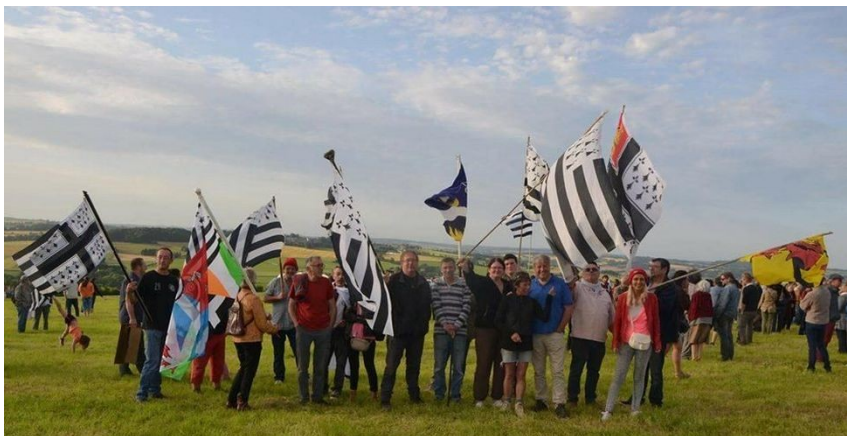
Bretons demonstrate against a mining project in central Brittany, April 2017

May I remind you that first way in Brittany is for political or territorial flags, using a staff usually on the vertical side of the flag.