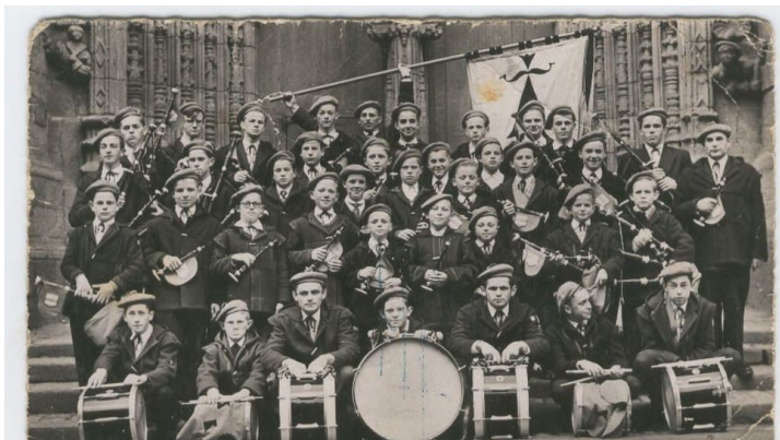
A vintage postcard showing a bagad: its flag appears at the rear; the staff is held horizontally but the devices are aligned to appear vertical

Instead of being worn on a vertical pole, the emblem is displayed on a horizontal pole. Have you seen that before in your countries? In Brittany, we mainly use that kind of display for cultural flags, especially those of the bagadoù and Kelc'hioù keltiek .