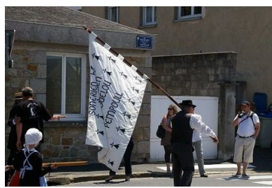
Above, flag of the Circle of Paimpol (Pempoull), obverse and reverse; left, the paddle and lifebelt is the symbol of the children's section