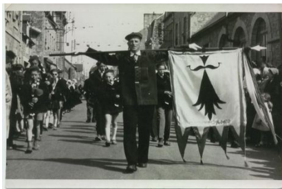
A bagad parades at Guingamp (Gwengamp), 1950s: the flagbearer rests the flag across his shoulders