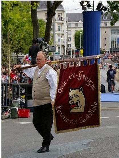
A bagad from Saint-Malo (Sant-Maloù) uses a paddle as a flagstaff

Some groups have a distinctive finial: an ermine spot, a triskell, a salamander.