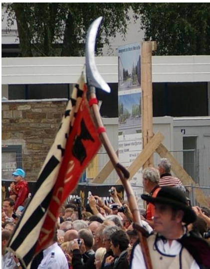
Scythe of Auray (An Alre): the flagbearer wears a black cloak to represent Ankou, a personification of Death in Breton mythology

Instead of a conventional flagpole, some groups use a traditional work tool, such as a paddle from the port of Saint-Malo, or a scythe from Auray.