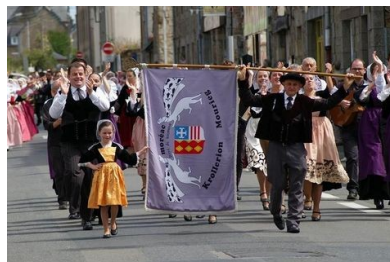
Flag of the Krollerion Mourieg, a circle from Moreac (Mourieg)