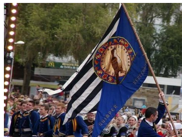
Flag of the Kerfeunteun Circle, from Quimper (Kemper)