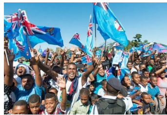
Left, a 12-year-old Fijian boy runs half a mile through canefields to watch the 2016 Olympic Rugby Sevens final on the nearest TV set. Right, homecoming of the victorious Fijian team.