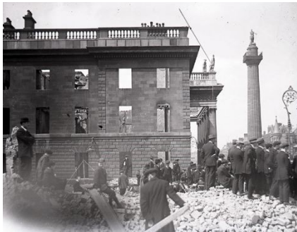
Ruined GPO and broken flagpole.