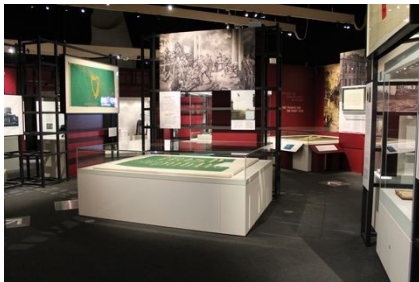
'Proclaiming a Republic', exhibition display, NMI.