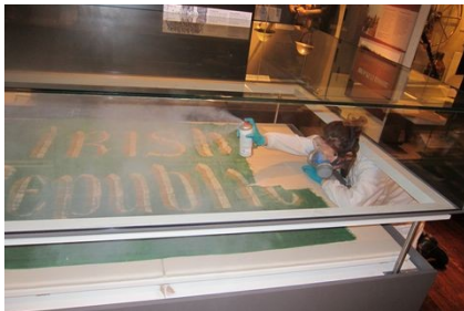
Temporary consolidation for removal from display.

Cyclododecane spray, which suspends the consolidant in a waxy form over the surface and gradually dissipates over time was found to be effective. 4 It has been previously used in paintings conservation, but tests found that it does not mark or damage the woollen substrate. 5 The components of the aerosol spray are extremely toxic and removal was carried out with limited personnel in protective masks and clothing. The spray deposited a visible white layer over the object, and a roller could then be inserted to allow access to the reverse. Delaminating paint was visible on the base board. Once completely covered in consolidant, the flag was boxed and transferred to the conservation department.