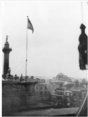
Flag flying over the GPO, April 1916.

public. However to further broadcast the message and as a visual statement of identity, on the left-hand corner of the GPO at Princes Street, a large green flag was hoisted, with the words, 'Irish Republic' in bi-coloured letters of white and orange, on both faces.