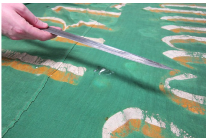
Bayonet and corresponding area of loss.

Comparison of the sample under magnification with the holes in the flag revealed multiple points of similarity. Both have a small punched circular area of damage, 5mm in diameter with limited distortion of the wider surrounding area. The diameter of a .303 bullet is 7mm, but the fabric contracts back into position once the bullet has passed through.