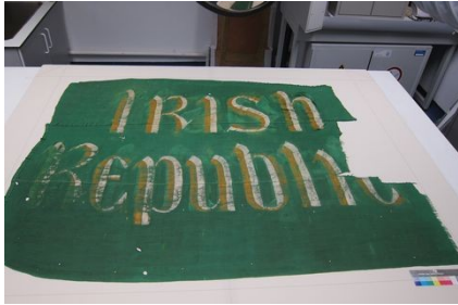
Flag after conservation.