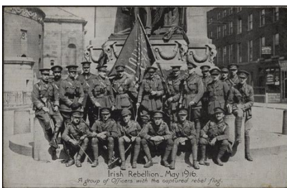
British troops with captured flag, 1916.

In 1966, on the 50th anniversary of the Rising, the flag was formally returned to Ireland by the British government and has been on display in the National Museum, Kildare St and later Collins Barracks, ever since. 3