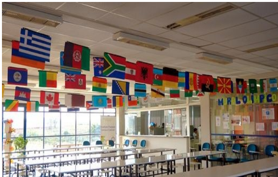
Flags A to D: campus entrance hall

To simulate the opening ceremony, the flags were alphabetically arranged in display lines and organised in three spaces of the modest campus building. Flags A to D were displayed in the entrance hall, while flags from E to J were displayed in the library, which is located to the left of the main campus entrance. Our goal was to give visitors a 180° view of the flags as they walked through the main entrance.