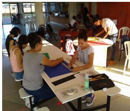
The flag-making process, March-July 2016