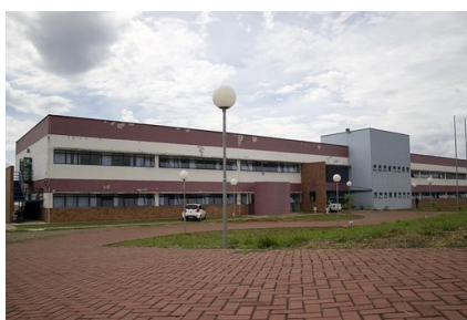
The IFSP Capivari campus