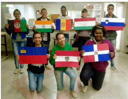
Our 'team' of students, 2016

The flag-making process was developed from March to July, the students meeting for teacher orientation activities during the late afternoon of Mondays and Tuesdays.