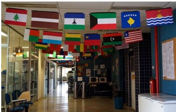
Flags K to M: next to the campus secretary and principal's room

The initial objective was to display the national flags at the campus during the entire competition period and to remove them after the end of the games. However, due to the success and visual impact of the project, they eventually remained until the end of September.