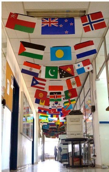
Flags N to Z: corridor of the administrative sector and teachers' rooms

Another important aspect of this project was its impact on the media.