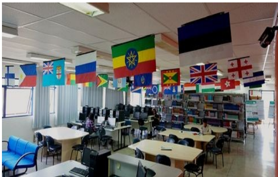
Flags E to J: library