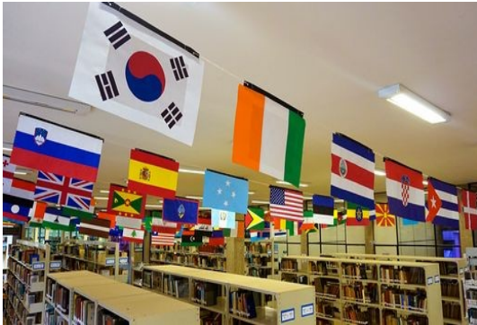
Flags exhibited in the library of São Paulo State University (UNESP)

In November 2016, at the invitation of the UNESP, the flags were exhibited in the library at its Rio Claro city campus. The students involved in the project had the opportunity to visit the university and also helped in the process of installing the exhibition, which remained at that institution until December 2016.