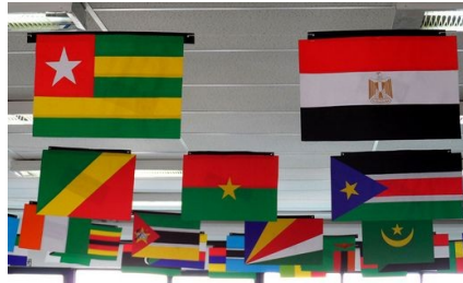
Exhibition of African flags, IFSP, Capivari campus, November 2015