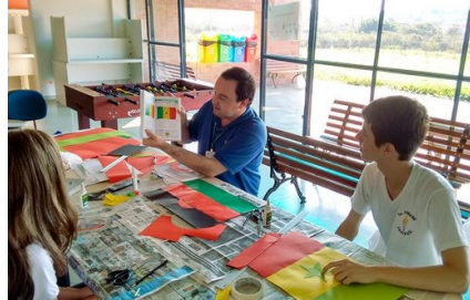
Showing the meaning and construction sheet of the pan-African flags

One of the first challenges was to establish a pattern for the flags to be exhibited and the type of paper for their manufacture. In addition, the importance of pan-African flags and their meanings was explained to students. At a later stage, the process of executing the pan-African flags started using the flag construction sheet, whose dimensions were found on the site www.vexilla-mundi.com . To ensure an equal and harmonious presentation, it was established that all national flags would have a maximum width of 30cm on the hoist.