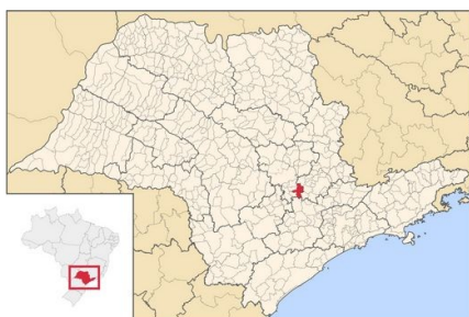
Capivari, São Paulo State, Brazil

Located 142km (88 miles) from the city of São Paulo, Capivari has 53,000 inhabitants and is considered a small city in Brazil. The IFSP Capivari also accepts many students from nearby cities, and offers integrated technical high school courses in the area of chemistry and computing and technological courses in computer science and graduation in chemistry. When I came to work as a geography teacher at the IFSP Capivari campus (in October 2014), the institution provided an opportunity to develop part of my research and extension activities with educational practices, and this way the idea of teaching vexillology for high school students arose.