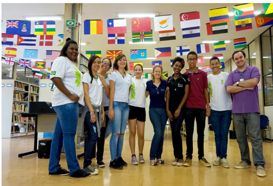
Our 'team' of students in the UNESP library, Rio Claro city campus.