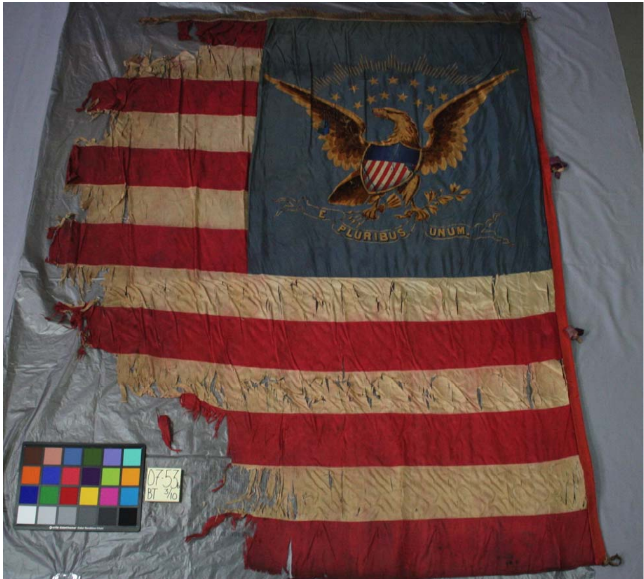
Figure 2. The reverse side of the flag before treatment.

The silk fringe is composed of twisted bullion threads and runs only 47” along the upper edge of the flag. The hoist, made of red worsted wool damask, is folded over and stitched with blue thread that secures the edge of the flag. The lower red strip has a selvedge edge but is also folded under.