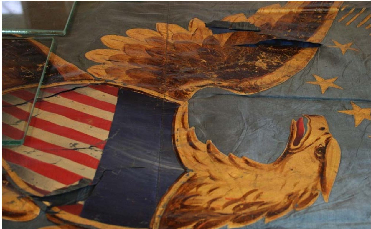
Figure 4. The folded and torn areas in the painted canton.

Three main fold lines were located in the canton that measured 10” to 14” long. Above them were shorter creases and several scattered diagonal folds. The larger folds in the group affected both layers of the blue silk canton. The blue silk of the canton was slightly faded. It was previously a much brighter blue, as can be seen in hidden area, but at the time had an overall yellowing effect. Red stripes in a hidden area at the hoist showed that they were also previously brighter in color. The painted eagle that is located on the reverse side of the canton had several tears and splits in the painted areas. The paint layers appear well secured to the silk. The prevailing damage to the paint is the numerous tears; two are 5” long, and others are compound “L”-shape tears. One tear runs diagonally, affecting both the warp and weft silk threads. Two were located in the paint and were folded under to one side of the silk layer. Typically the slits were just in the painted areas, whereas the unpainted silk was folded. (Figure 4)