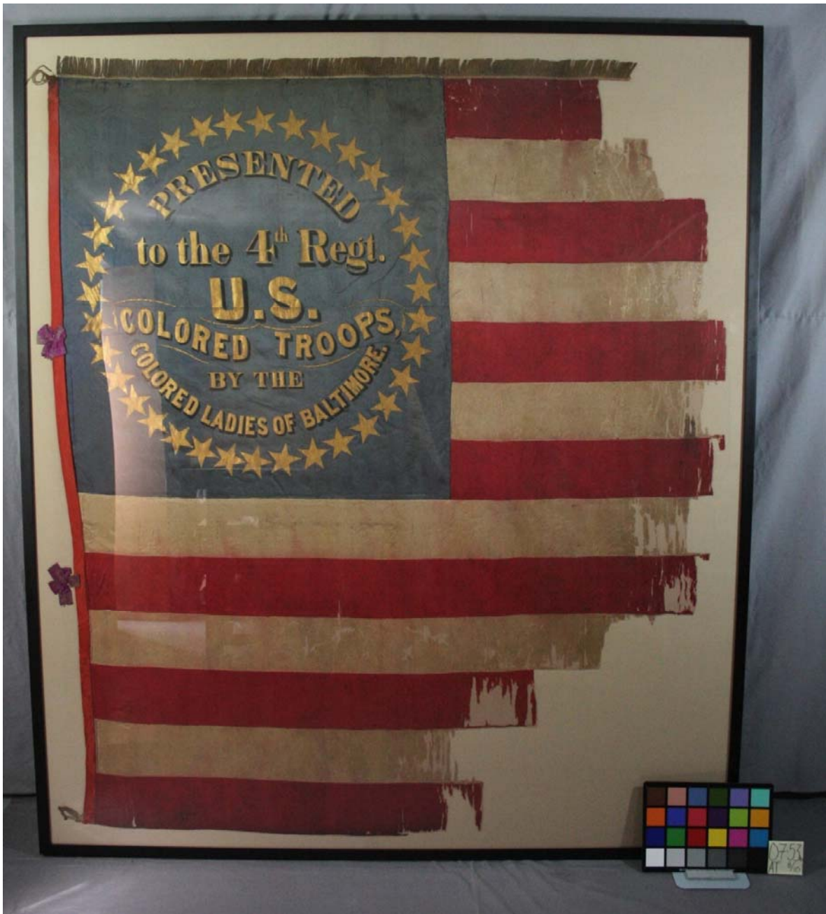
Figure 5. The obverse side of the mounted flag after treatment.