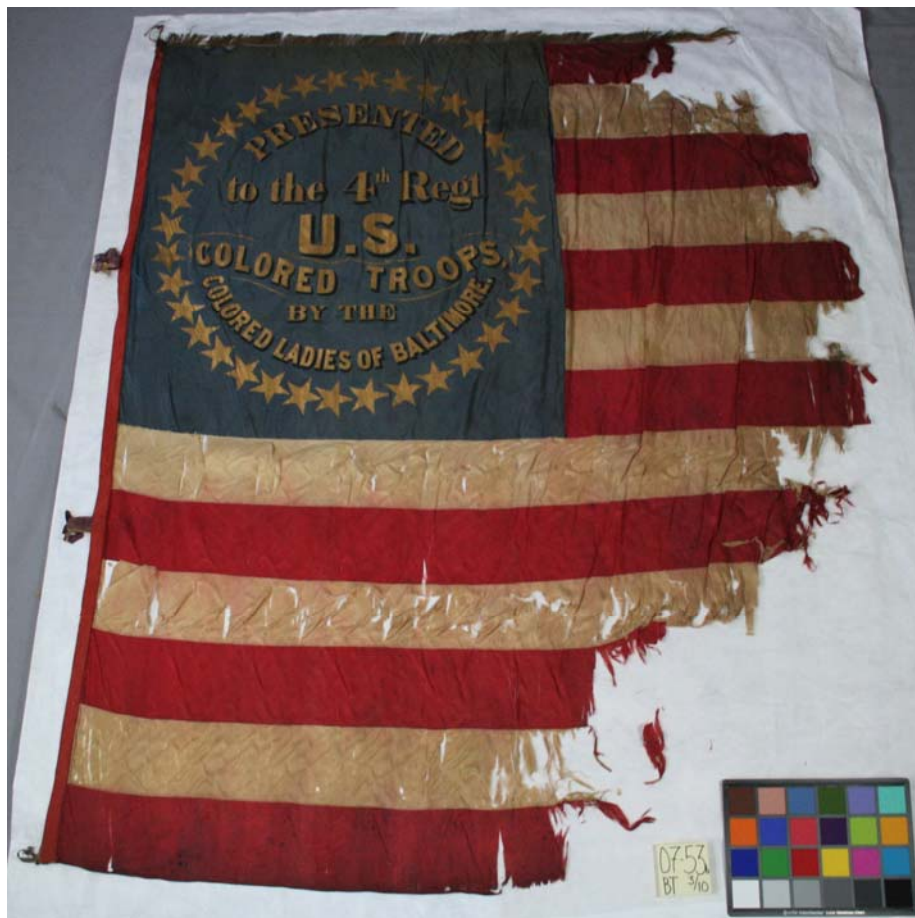
Figure 1. The obverse side of the flag before treatment.

This United States national flag has a canton that is constructed of two layers of blue silk with the outer sides painted. The obverse is painted in gold with black highlights and reads “PRESENTED / to the 4 th Regt / U.S. / COLORED TROOPS, / BY THE / COLORED LADIES OF BALTIMORE.” It has 35 stars in a circular pattern around the text. (Figure 1)