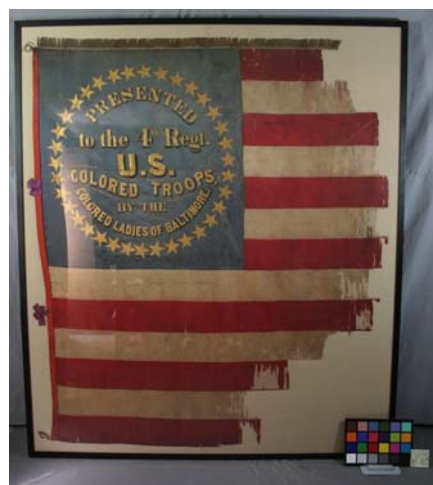
The obverse side of the mounted flag after treatment

This talk will discuss the history of the flag and the United States Colored Troops, Union Army. The methods employed in the flag’s conservation and mounting will also be highlighted in the presentation.