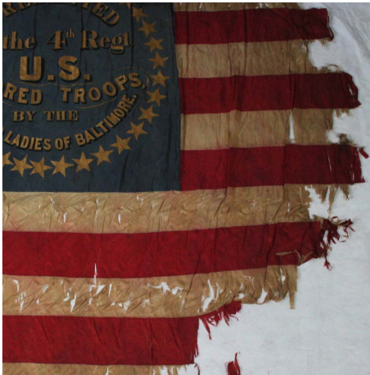
Figure 3. The creasing directions found at the stripes of the flag

Much of the damage evident is related to the flag being rolled tightly onto its staff for an extended time period. The two layers of the blue silk fabric dominated the direction that the silk was rolled. The added layer in the canton made a thicker roll with which the lower stripes had to compensate, resulting in diagonal creases in the lower stripes. (Figure 3)