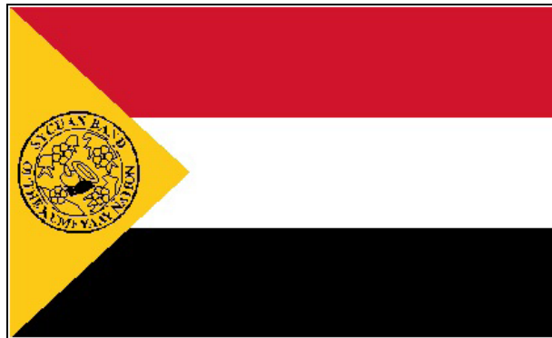
Sycuan Band of the Kumeyaay (Diegueño) Nation

This paper will present a brief history of the reasons behind the abundance of tribes and will present brief histories of some of those tribes. As symbols of the various tribes, their flags will be shown and their symbolism explained. It will show how the modern tribal emblems were created based upon their distinct and shared histories. While time constricts the number of tribes that can be detailed, flags of other San Diego and Southern California tribes will at least be shown.