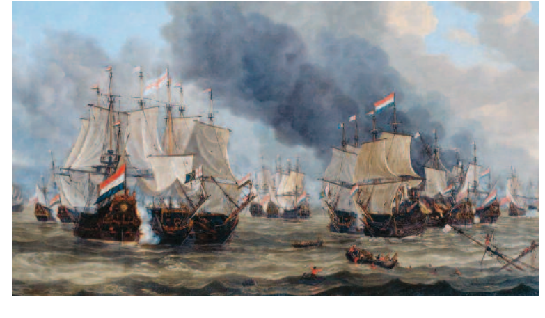
The Battle of Leghorn (14 March 1653) by Reinier Nooms

The sole surviving example of an actual flag from this period was rediscovered long afterwards in a locker in a naval dockyard, and is now in the National Maritime Museum in London. It may have been an attempt to create a flag conforming to what