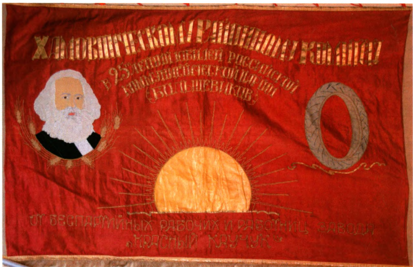
The banner to the Khamovnichesky RCP unit of Moscow by the workers of machine-tool plant "Krasnyj Kautchuk". Portrait of K.Marx. The tire as an example of ready-made products. Silk, gold lace, applique work. 136x250