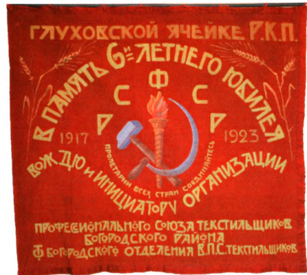
The banner gifted to the Gluhovskaya unit of RCP by Bogorodskoye unit of all-Russian trade union of textile workers. Moscow region.

On the jubilee banners made to the 25-th party anniversary, the sickle and the hammer emblem was most often presented as a component part of compositions, added with symbolic images of the shining sun, the Globe, the flaming torch, laurel wreaths, widely used during the February revolution as the implementation of freedom and solidarity idea. Thus, the gift banner presented to Gluhovskaya unit of RCP by Bogorodskoye unit of all-Russian trade union of textile workers, the sickle, the hammer and the blazing torch are united into one composition. At the end of 1920-s the image of torch on the banners was hard to find. To that time Lenin’s idea of the “world revolution” was replaced by an objective “for construction of socialism in one separate country”, set by J. Stalin. Numerous variants of “the sickle and the hammer” emblem had went away, and the tendency for unification was clear. In the next decade this emblem, as well as the sun and the five-point star were often represented in the