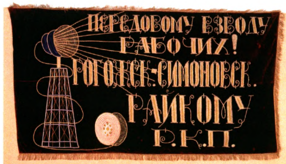
The banner to the Party Committee of Rogoshsky district of Moscow by the workers of cable plant, Moscow. The cable bobbin near the tower and the searchlight. Velvet, metal thread, embroidery. 94x174

The allegory of workers union presented as figures of worker and peasant, tying the union with handshake, remained to be one of the most popular. On the jubilee banner of