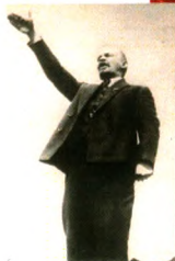
Photo of V.Lenin delivering the speech on the Red Square on the 1-st of May, 1919.

“the leader”, even “the father”. Many were talking