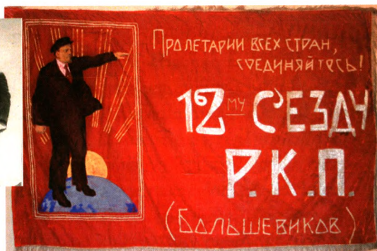
The banner to the 12th congress of RCP by the workers of Dinamo plant, Moscow. Portrait of V.Lenin Silk, gold and silver lace, applique work; painting. 142x224