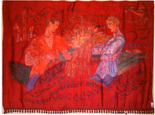
The banner of Dulyovo porcelain factory gift to the 12-th Congress of RCP Moscow region. Silk, painting. 140x205

Dulyovo porcelain plant it was, without any doubts, made by the professional artists: a worker with compasses and drive gear against the background of smoking funnels, a peasant with a sheaf against the fields and huts. The rising sun is placed in the center, and there is a slogan above: "Let the union of workers of the world strengthen and grow under the banner of RCP and the III-rd Comintern". The best findings of soviet propaganda porcelain – first of all those made by famous artists - were used in the decorative design of the banner – the black and white artists S.V. Chehonin and A.V. Schekotihina-Pototskaya, whose