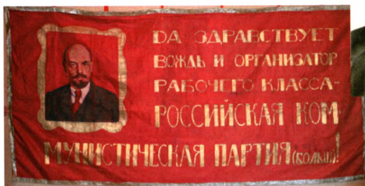
The banner to the Rogoshsky unit of RCP by the workers of Moscow rope factory Portrait of V.Lenin Silk, painting. 102x210

Portraits of leaders – mainly K. Marx and V. Lenin - appear on the jubilee banners of 1923 – painted in oil, embroidered famous usually portrayed by the photographic portraits made