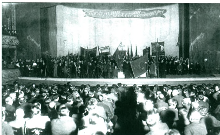
The delegations of the non-Party workers on the stage of the Bolshoi Theatre. The 13th of April 1923

Banners were presented with pride, like a relic. The picture from our museum’s funds records a ceremonial moment: non-party workers, greeting the congress, are standing in front of the delegates at the Bolshoi Theatre’s scene with their banners. A picturesque group with unfolded gift banners raised over the heads impresses emotionally and reminds of the final scene of the play – the demonstration or the religious procession. The latter comparison is intensified by presence of banners having the church banner structure.