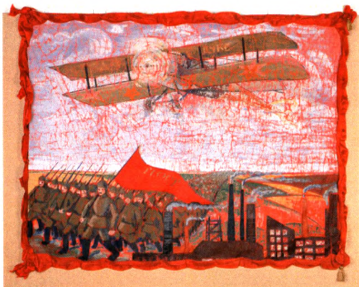
The banner to the 12th congress of RCP by the workers of aviation enterprise Duks, Moscow. Silk, painting. 131x164

The issue of Soviet republic’s happy future can also be heard in the graphic design of banners. The banner of workers from the state aviation enterprise Duks, which was presented to the 12 th congress of RCP(b), has painted columns of Red Army men, marching from the horizon, their commanding officer is