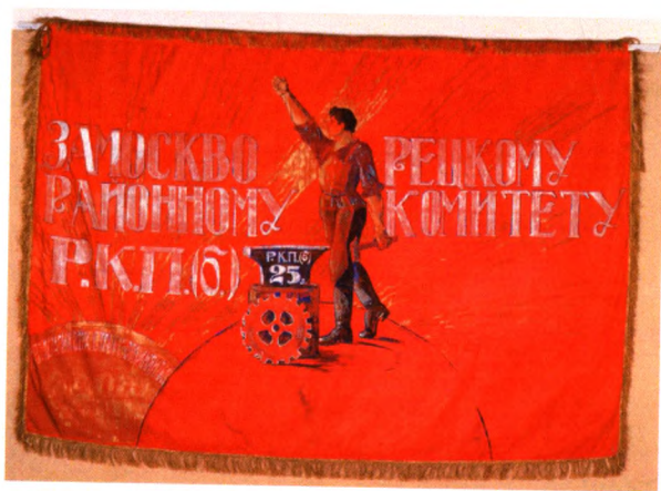
The banner by the workers of engineering plant Krasny Proletarii, Moscow Silk, painting. 162x236