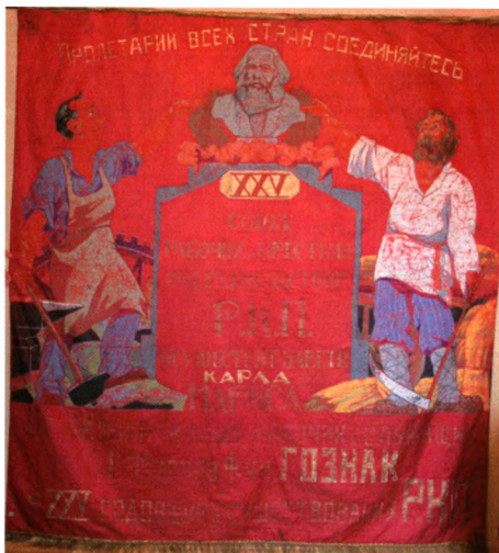
The jubilee banner of the Moscow factory of monetary signs “Goznak”. The worker and the peasant with industrial and agricultural implements of productions depicted on the cloth. Silk, painting. 203x193

In the next decade trade union emblems replace various graphic compositions on the banners.