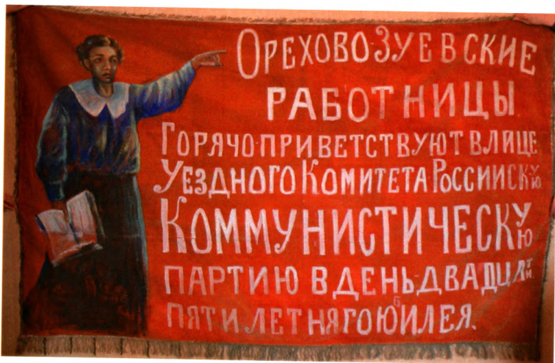
The banner to the Orekhovo-Zuevo unit of RCP by the women-workers of textile factories, Moscow region. Velvet, painting. 140x205

The activation of women at the public arena found its reflection in the pictures and slogans of gift banners, presented by them. The words of gratitude to the party and the new power are peculiar for “women” banners. The banner of Orekhovo-Zuevo weavers bears the