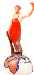
N.Danko. Sculpture "A call from the East", porcelain, 1922