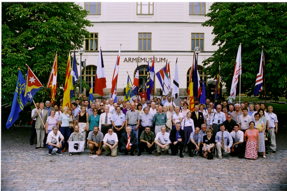
Congress participants gathered in front of the Army Museum, Tuesday 29th July.