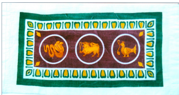
18. Western District, Sri Lanka