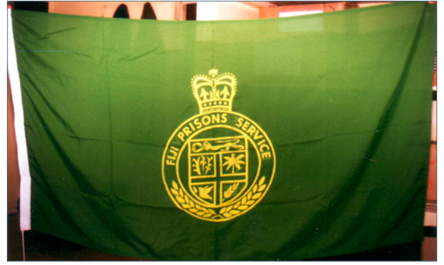
7. Fijian Prison Service

Before leaving Suva for the airport I stopped in front of the main jail looking for the administration office, it was not easy but I received permission to photograph that particular flag, green with a yellow shield (Fig. 7).