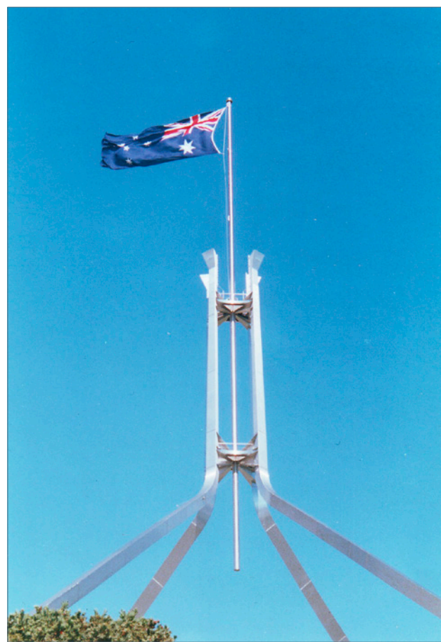
10. Australian Flag at Parliament House

After that visit we were welcomed at the office of National Orders where a briefing was organized showing us the medals and decorations of Australia. Another meeting took place along the Lake with a representative of the Protocol. Along the road there is an alley of 60 flagpoles with the flags of the countries having a diplomatic representation in Canberra.