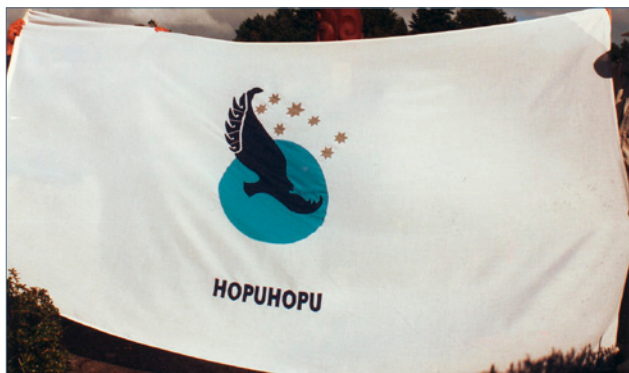
9. Hopu Hopu Site

religious reasons. In front of the gate the flag of Hopu Hopu Site, white with a turquoise-blue sun, a dark blue bird and name and a gold constellation of 7 stars. I tried for one hour to film and photograph the flag but it was so big and heavy it was impossible to fly. I met the guard asking for information about the symbolism, after discussion he proposed to lower the flag and I took a very good photograph! (Fig. 9).