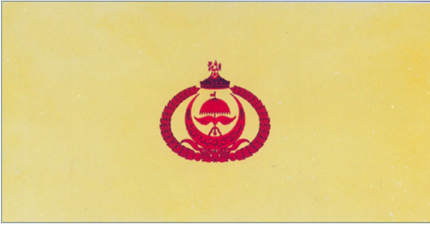
14. Wife of HM The Sultan