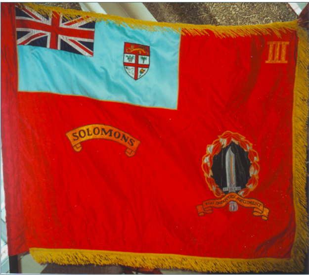
6. Fijian Regimental Colour

Before leaving I remembered the Fijians had Colours: it meant new calls to the chief, a new wait and a new authorization. We saw the 3 rd Fiji Infantry Regiment Presidential Colour, it was a square red flag, in the canton, the Fijian national flag, in the upper part of the fly, the gold cifer III, in the lower part of the fly, the badge of the Regiment in colour, and beneath the national flag, a gold scroll bearing the word “Solomons” reference to the Second World War (Fig. 6). A second flag is the Colour of the Regiment itself, it differs from the previous one, it is red, the cifer III in the upper canton, the badge and scroll in the centre. In front of the building flew another flag, red over green with the badge on a white shield having the shade of a shell.