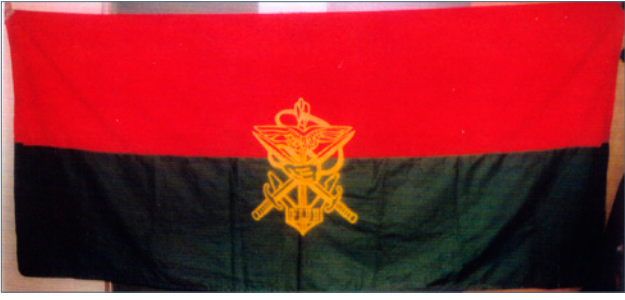
5. Fijian Army Flag

Before leaving I remembered the Fijians had Colours: it meant new calls to the chief, a new wait and a new authorization. We saw the 3 rd Fiji Infantry Regiment Presidential Colour, it was a square red flag, in the canton, the Fijian national flag, in the upper part of the fly, the gold cifer III, in the lower part of the fly, the badge of the Regiment in colour, and beneath the national flag, a gold scroll bearing the word “Solomons” reference to the Second World War (Fig. 6). A second flag is the Colour of the Regiment itself, it differs from the previous one, it is red, the cifer III in the upper canton, the badge and scroll in the centre. In front of the building flew another flag, red over green with the badge on a white shield having the shade of a shell.