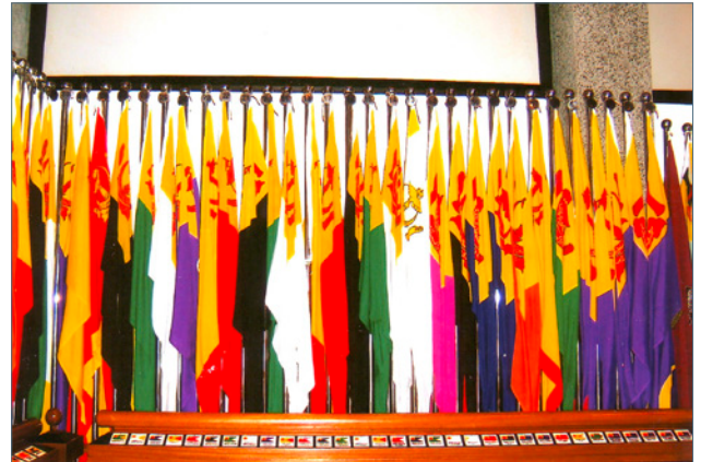
11. The Royal Regalia Museum

the Royal Regalia Museum for the first time, my heart was beating fast, 119 flags were displayed in the museum and it was forbidden to take photographs! You can imagine how I felt at that moment, a lot of unknown flags in front of you and you can only look! (Fig. 11-12-13).