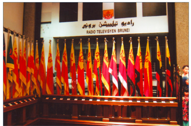
13. The Royal Regalia Museum

I knew my predecessor as FIAV President, William Crampton had visited the Museum and had not received permission to photograph. When you have been looking for such information for a long time the stress is big. I stayed a few hours to visit but also to note all the references of those big flags and draw some. What to do to get special permission to photograph? After hours of discussion with the Director of the Museum and representatives of the government at the Parliament, I received the book on the