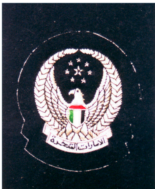
19. UAE Police Flag

In fact I had the copy of the badge on my visa application form and I could reconstruct the flag, the Police flag is blue with a white badge (Fig. 19).