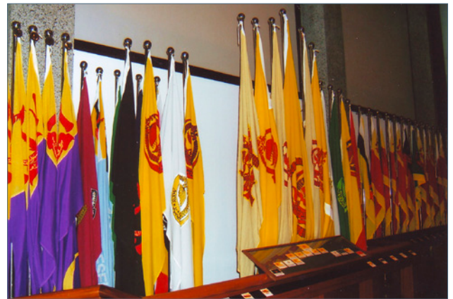
12. The Royal Regalia Museum