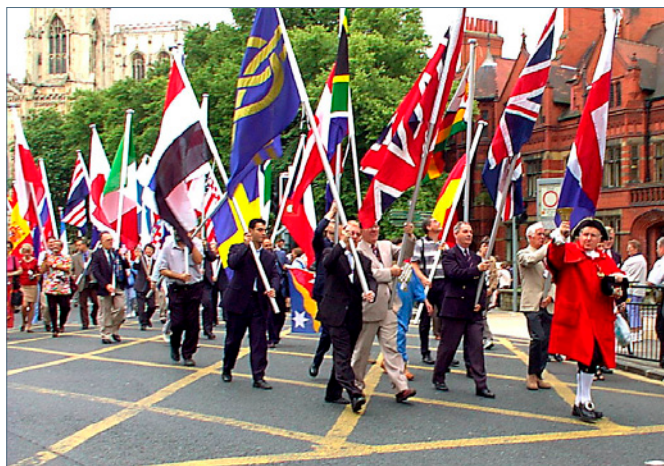
Flags parade through York's streets

Other papers covered Tudor flags, flags of Argentina, political flags in the Czech Republic and Slovakia, Royal Standards of Southern Africa, attempts to change the flag of New Zealand, flags of Cornwall and the International Brigades in the Spanish Civil War, signalling flags, flag tattoos, Ottoman decorative finials, "One Nation under God" - an analysis of religious aspects of the US Flag, flags of the Canton of Vaud and of Italian states, Dutch military colours, 100 years of flags in Ohio, British sledge flags of polar explorers, political flags in Senegal, flag stamps of Australia, flags of Scotland and Wales and porting Flags. The last paper was an interesting and amusing coverage of Flags in Comics, the Case of Asterix, the Gaul, by Dr Marcus Schmöger, in which York was shown on the map of England as a stronghold of vexillology in an otherwise vexi-ignorant wilderness.