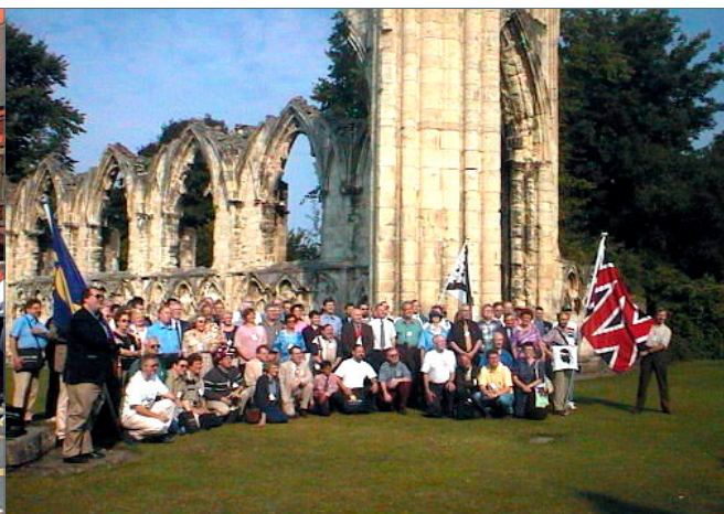
Over 100 vexillologists attended