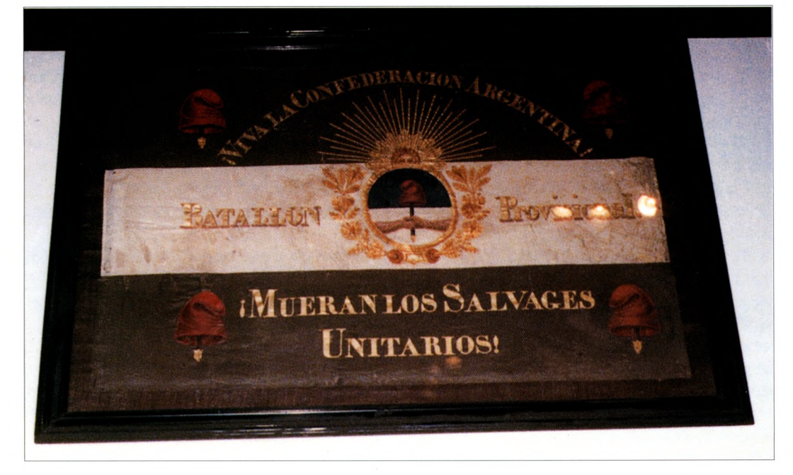
Fig. 2 Colour of a Provincial Battallion used during the Argentine Confederation. (National Historical Museum, Buenos Aires, photograph by the author, with kind permission)