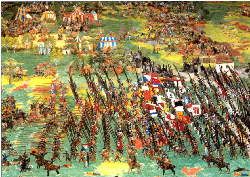
A tin figure diorama showing the main Swiss confederate forces at the battle of Murten, 1476.

14.30 Visit of the chocolate factory «Lindt & Sprüngli» in Kilchberg