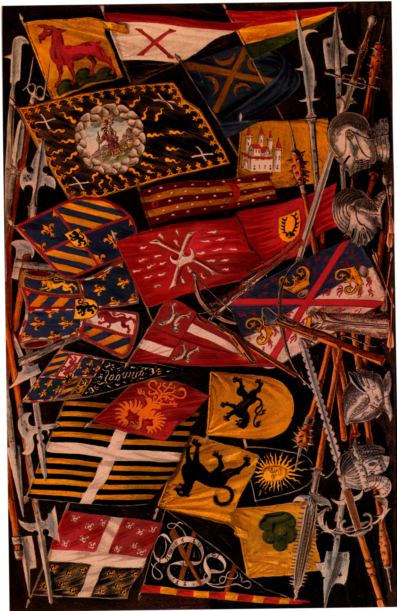
Trophies from the Zurich arsenal. Coloured copper plate by Franz Hegi. 1849. (From: «Neujahrsblatt der Feuerwerker-Gesellschaft», Zurich, 1849, p. 48)