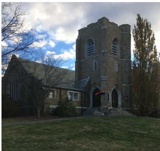
Winchester Unitarian Society, Winchester, Massachusetts